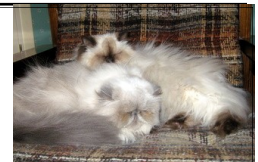
Misty, Mocha & Jazz