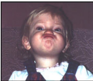
Daddy's pretty little girl??