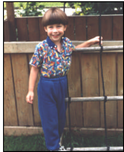
I'm all set for school, Mom!