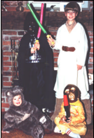
Darth Vader, Luke Skywalker, an Ewok and C3PO prepare to Trick-or-Treat.